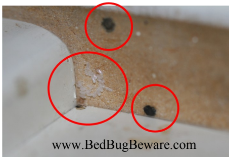
FAECAL TRACES AND EGGS ON A BED SIDE TABLE.

IF YOU ARE USING K9 SCENT DETECTION TEAM IT IS ESSENTIAL THAT THEY DO NOT RELY UPON THE DOG ALONE, THEY SHOULD INSTEAD CONFIRM SIGNS BEFORE TREATMENT.