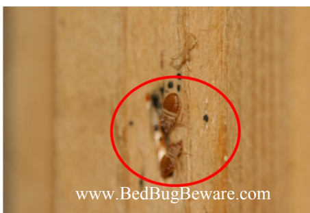
FAECAL TRACES AND EGGS ON A BED SIDE TABLE.

IF YOU ARE USING K9 SCENT DETECTION TEAM IT IS ESSENTIAL THAT THEY DO NOT RELY UPON THE DOG ALONE, THEY SHOULD INSTEAD CONFIRM SIGNS BEFORE TREATMENT.