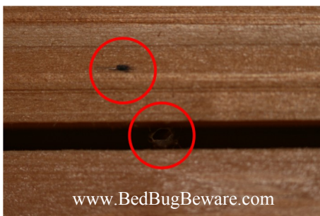
FAECAL TRACES ON A BED SIDE CABINET AND A CAST SKIN IN THE CRACK.

YOU CAN ASK YOUR PCO OR INSPECTION TEAM TO CONFIRM AND RECORD THE SIGNS THEY FIND IN THE AREA BELOW: