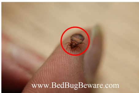
ADULT BED BUG FEEDING ON AN ADULTS FINGER.

WITHOUT THESE CONFIRMING SIGNS TREATMENT FOR BED BUGS SHOULD NOT PROCEED AND EFFORTS SHOULD BE MADE TO ESTABLISH WHAT THE CAUSE IS.